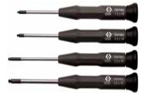
4839 XM screwdriver set

Set of 4 Precision screwdrivers. Containing one of each of T4880X 1.5 x 60, 2.5 x 75, 3.0 x 100mm Slotted. T4882 Ph 0 x 60mm Phillips.